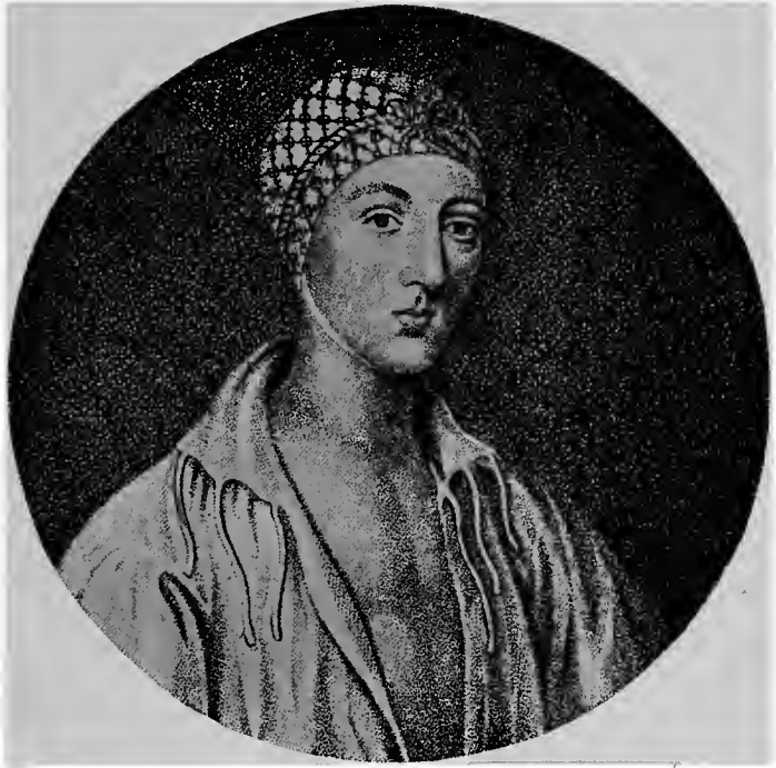
THE DUKE OF RICHMOND